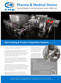
BULK FEEDING & PRODUCT SINGULATION SYSTEMS

CME offer a wide range of complementary technologies which can be integrated as part of a comprehensive automation solution, examples of these include: