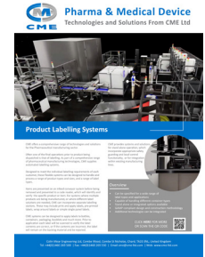
PRODUCT LABELLING SYSTEMS

For more information and literature on any of these systems, or to discuss a specific application, please e-mail: