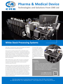
WHITE STOCK PROCESSING SYSTEMS