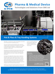
PICK & PLACE & TRAY HANDLING SYSTEMS