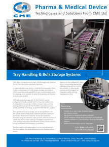
BULK STORAGE & RETRIEVAL SYSTEMS