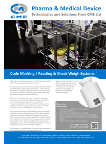
CODE MARKING / READING & CHECK WEIGHING