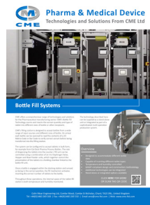
BOTTLE FILLING SYSTEMS