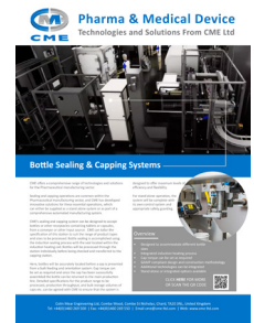
BOTTLE SEALING & CAPPING SYSTEMS